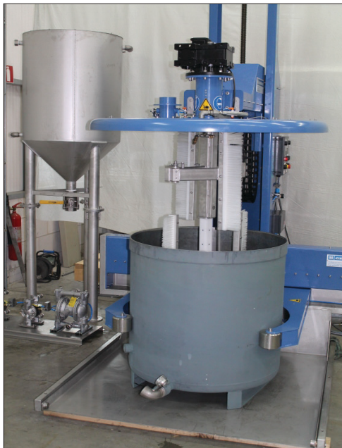
GemiClean VW model incl. sedimentation system.